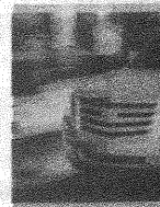
2018 MODEL CLEARANCE

Courtesy Transportation vehicle #C9F007 with 3,175 accrued miles.