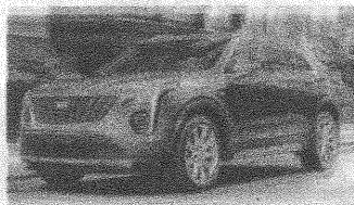
2019 XT4 LUXURY

ULTRA-LOW MILEAGE LEASES FOR WELL-QUALIFIED LESSEES