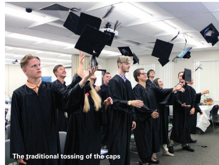
The traditional tossing of the caps

Citrus County’s Phoenix Rising was an 11-week, 352-hour program in partnership with WTC, Habitat for Humanity of Citrus County, and CareerSource CLM. It was based on a successful program launched in Marion County in 2011 which expanded to Crystal River in 2015 and Inverness first in 2016 then reprised this spring to building on the booming interest in construction, an industry slated to grow in the three-county region by 12.7 percent through 2026.